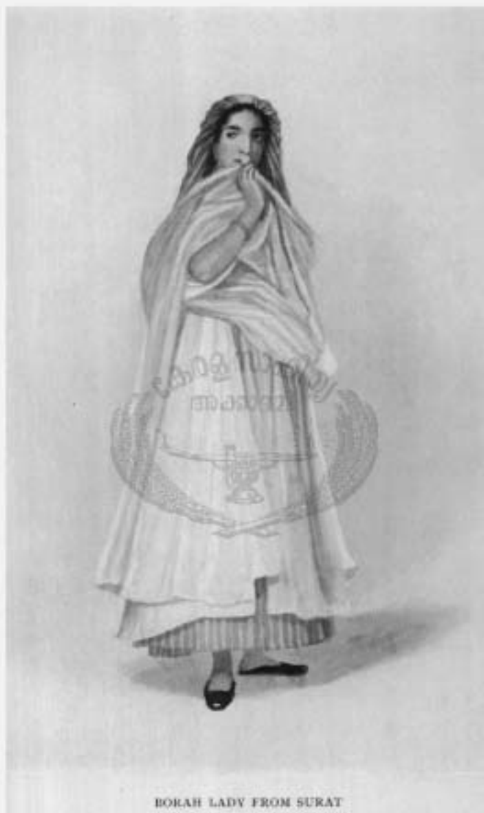
BORAH LADY FROM SURAT